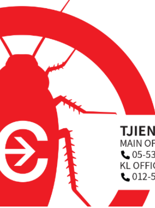
Bambang S QC Employee